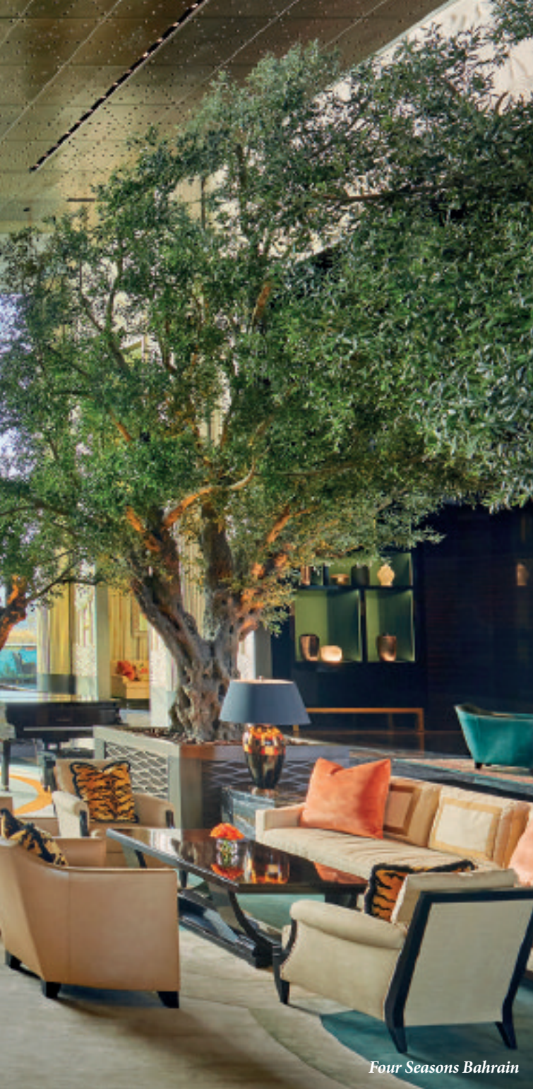
Four Seasons Bahrain