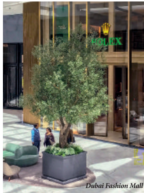
Dubai Fashion Mall

Designed with safety in mind too, their FireSilx products range is manufactured using fire resistant materials and rigorously tested to meet safety standards across the globe. FireSilx foliage can be made fully bespoke or ordered off-the-shelf, including topiary hedging, hanging baskets, flowers,