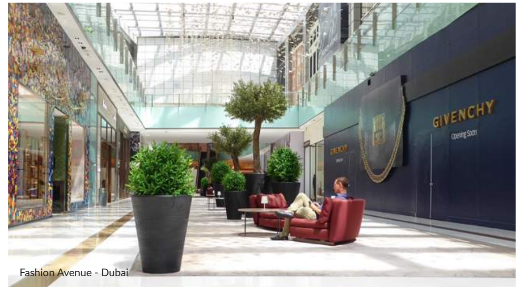
Fashion Avenue - Dubai