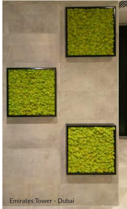
Emirates Tower - Dubai