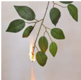
FIRE SILX FOLIAGE