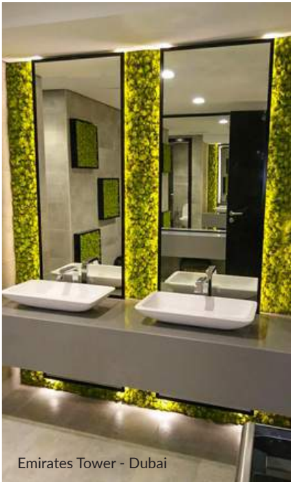
Emirates Tower - Dubai