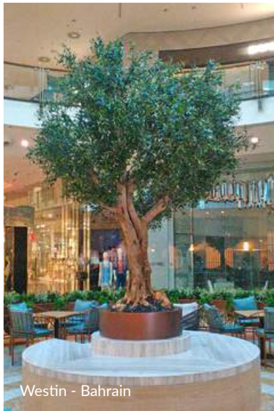
Westin - Bahrain

Our real trunks come from sustainable sources from either local or overseas suppliers. We begin by kiln drying the trunk to preserve the wood and remove any unwanted bugs. We add our canopy frame on top by using clever techniques that disguise any joins. Finally, we foliate with one of our premium FireSilx foliage choices. We end up with a tree preserved for life with the beautiful natural features nature produces.