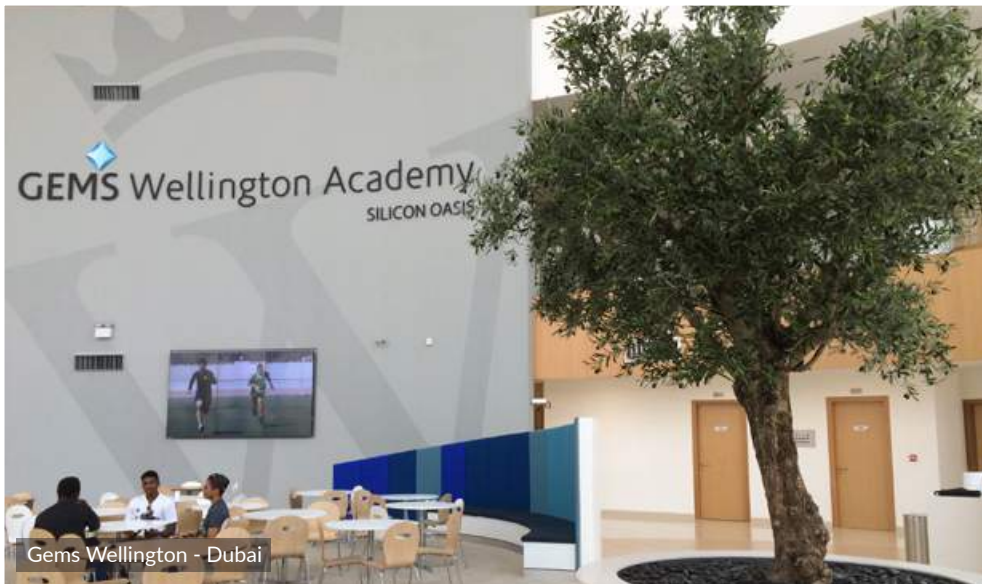
Gems Wellington - Dubai