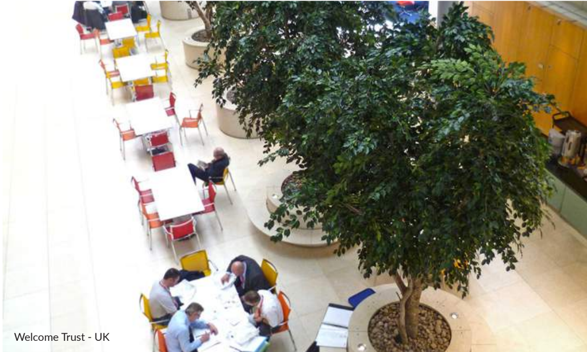
Welcome Trust - UK