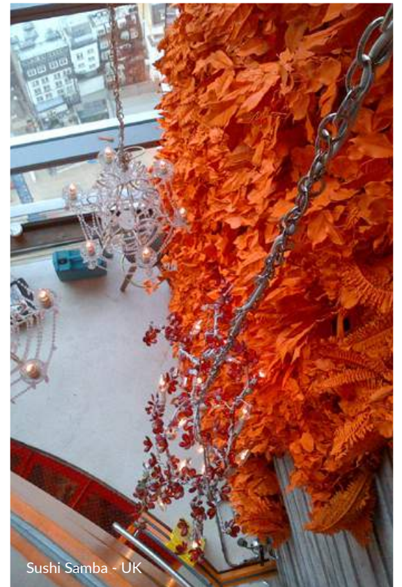
Sushi Samba - UK