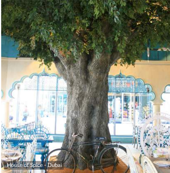
House of Spice - Dubai