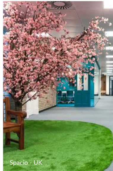
Spacio - UK