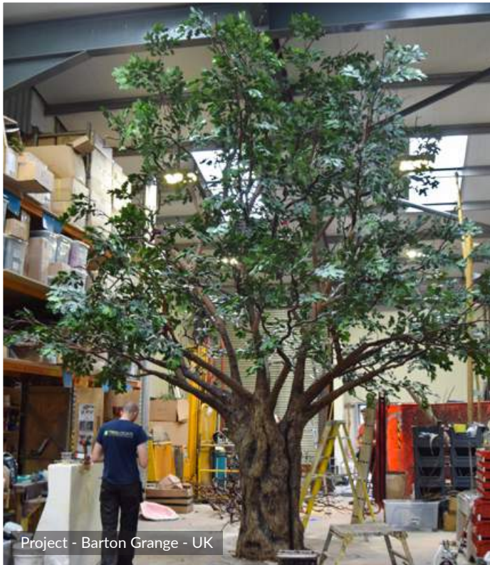
Project - Barton Grange - UK