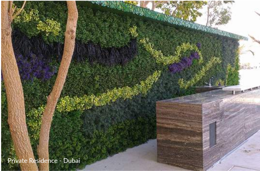
Private Residence - Dubai