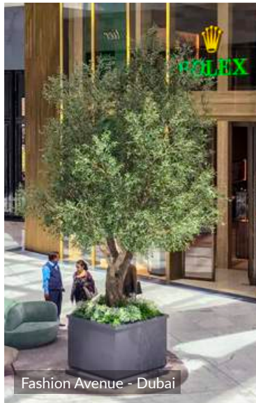
Fashion Avenue - Dubai