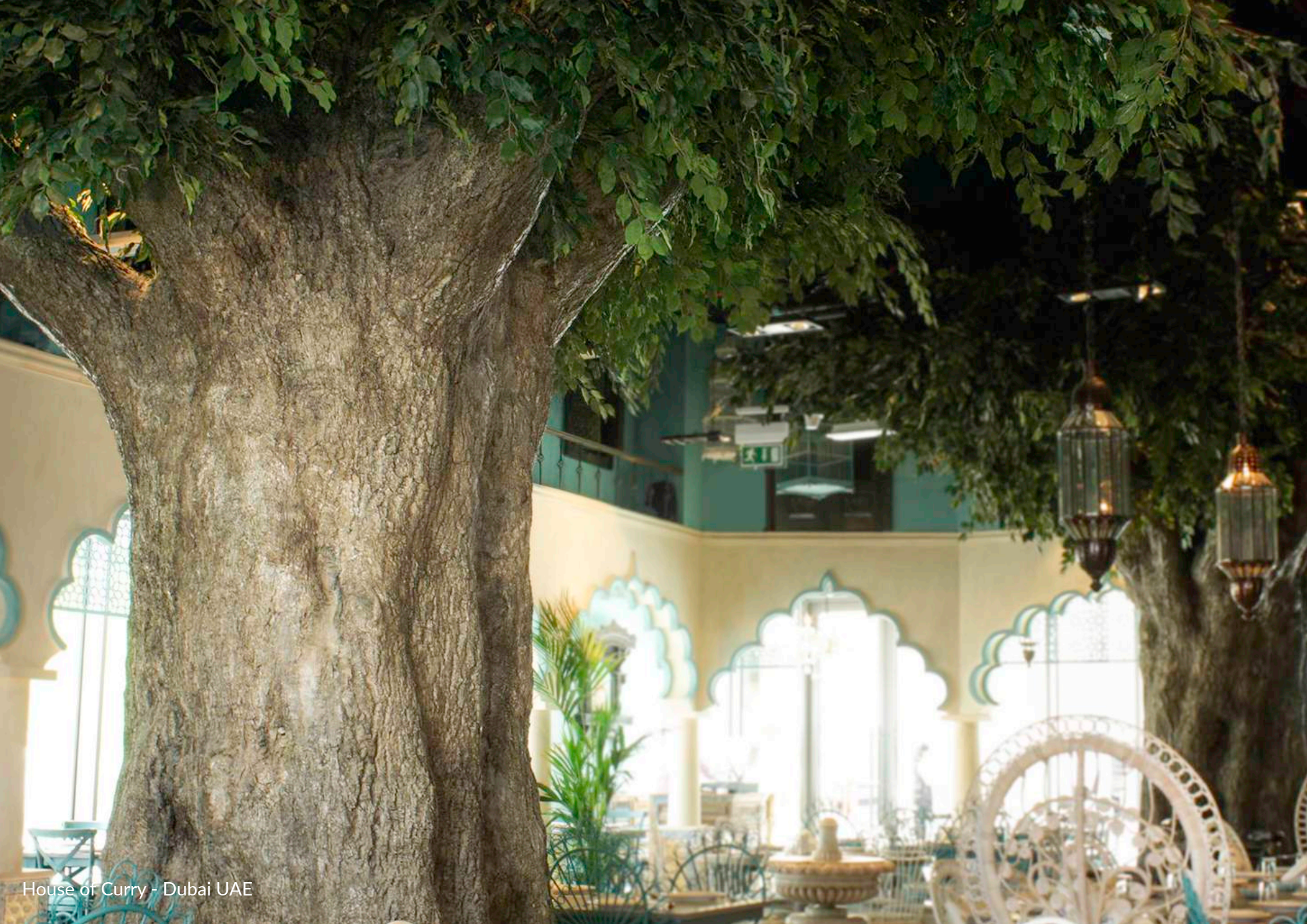
House of Curry - Dubai UAE