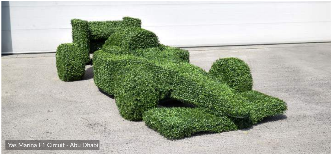
Yas Marina F1 Circuit - Abu Dhabi