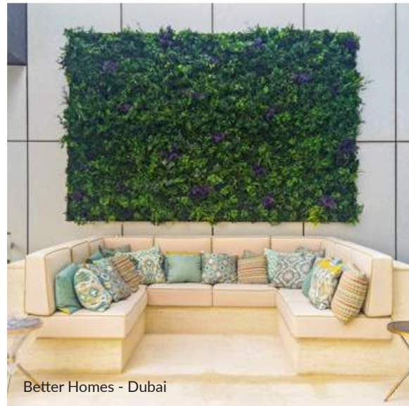
Better Homes - Dubai