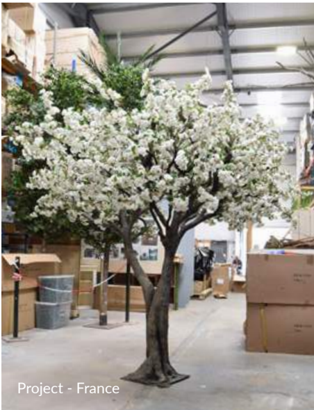
Project - France