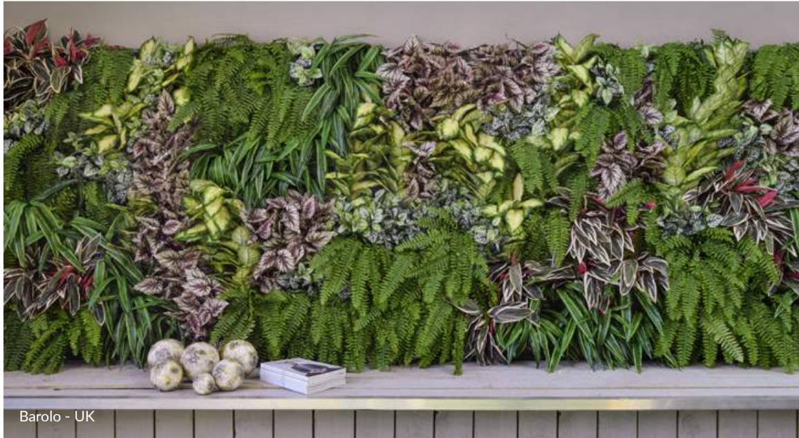
Barolo - UK