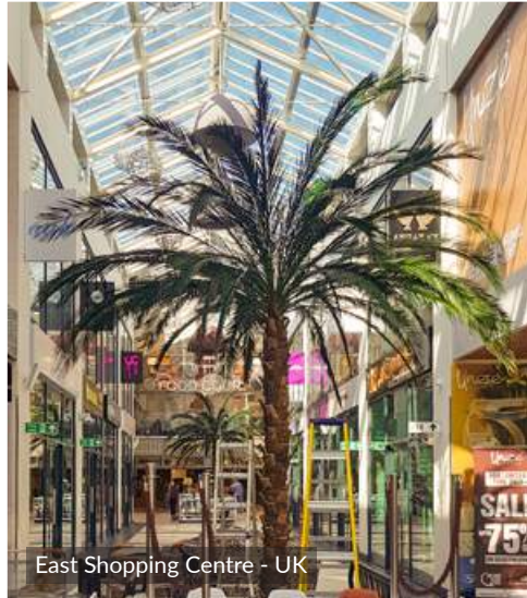
East Shopping Centre - UK