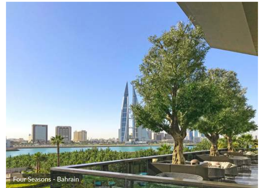
Four Seasons - Bahrain