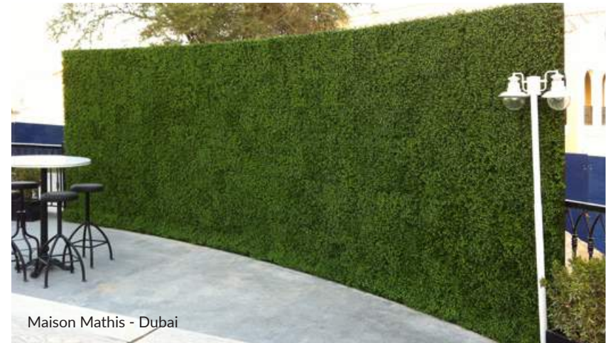
Maison Mathis - Dubai