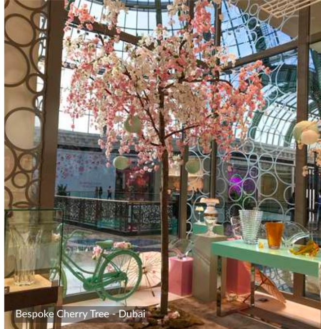
Bespoke Cherry Tree - Dubai