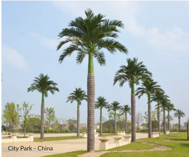
City Park - China