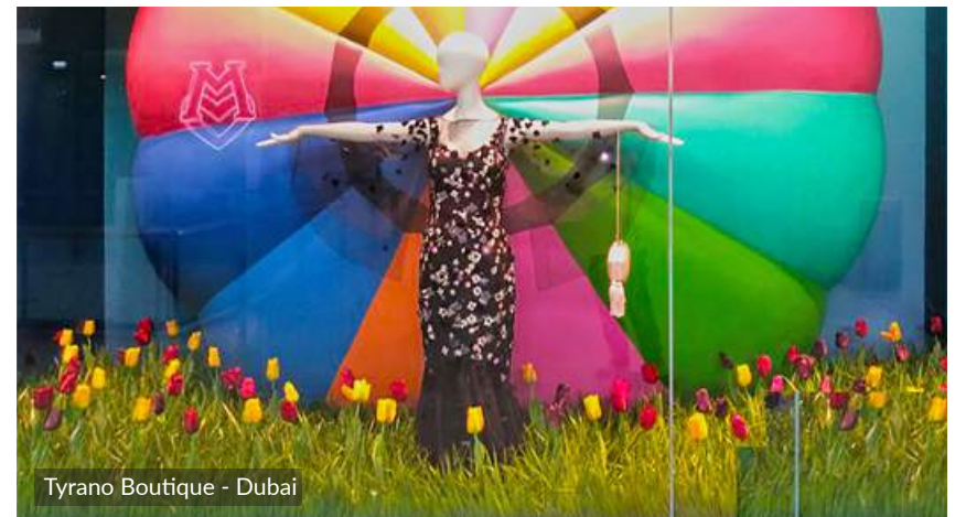
Tyrano Boutique - Dubai

Artificial flowers are the perfect way to add instant longterm beauty and colour to any space. No matter what the lighting conditions or your horticulture skills, enjoy stunning eye-catching window displays, seasonal floral decorations and year-round blooms in both commercial and private settings with zero maintenance costs. Our impressive selection of flowers and plants are always in stock and ready to ship.