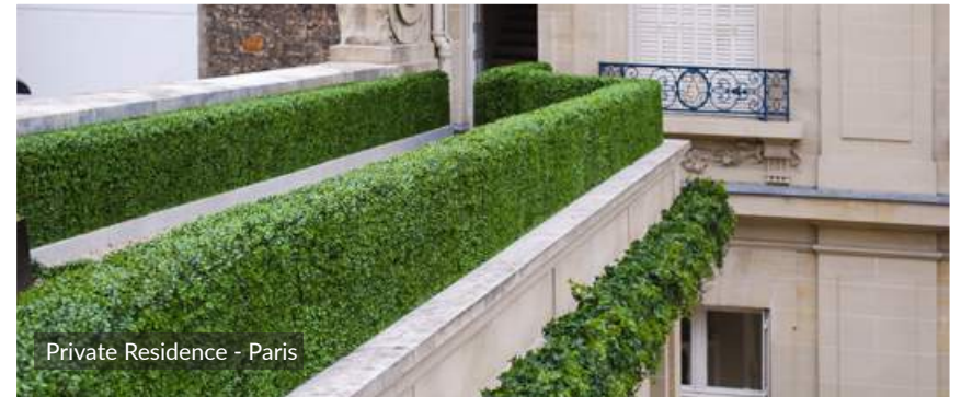
Private Residence - Paris

Our premium artificial hedging and topiary is the best way to get the classic boxwood and topiary look without the time and maintenance needed. We start with only the best materials to create a strong and stable structure that will stand up to all weather conditions. We then add our FR & UV matting of lush green boxwood or buxus. We also have a brilliant selection of timeless topiary shapes in stock ready for next day dispatch.