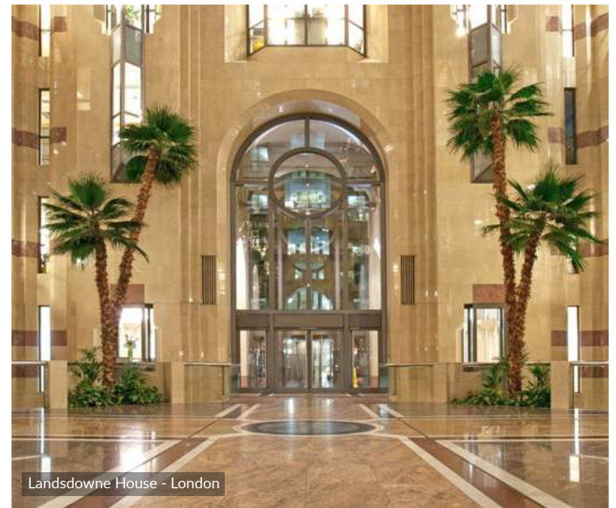
Landsdowne House - London