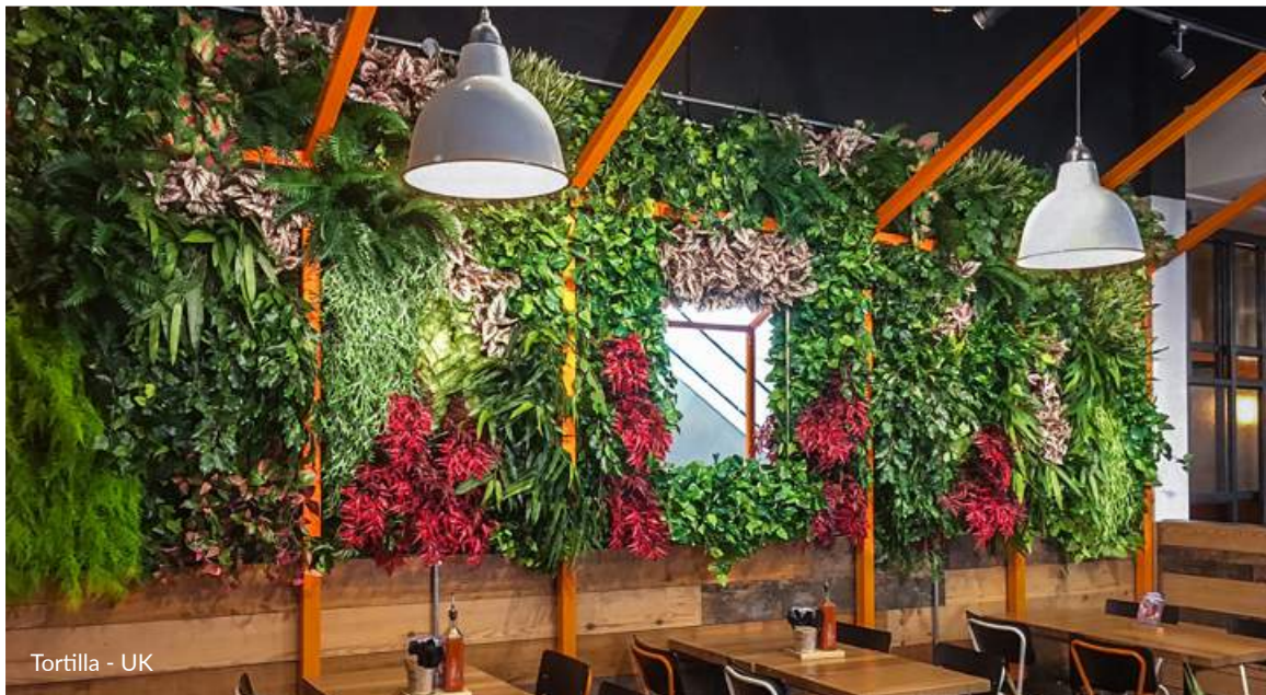
Tortilla - UK