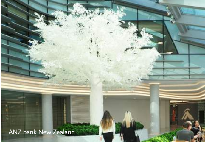
ANZ bank New Zealand