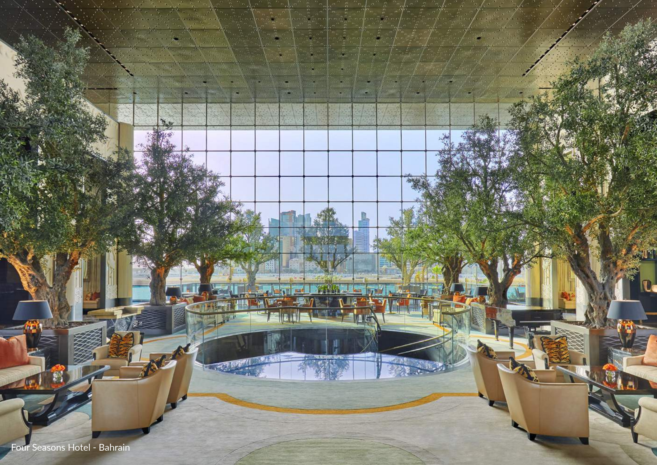
Four Seasons Hotel - Bahrain