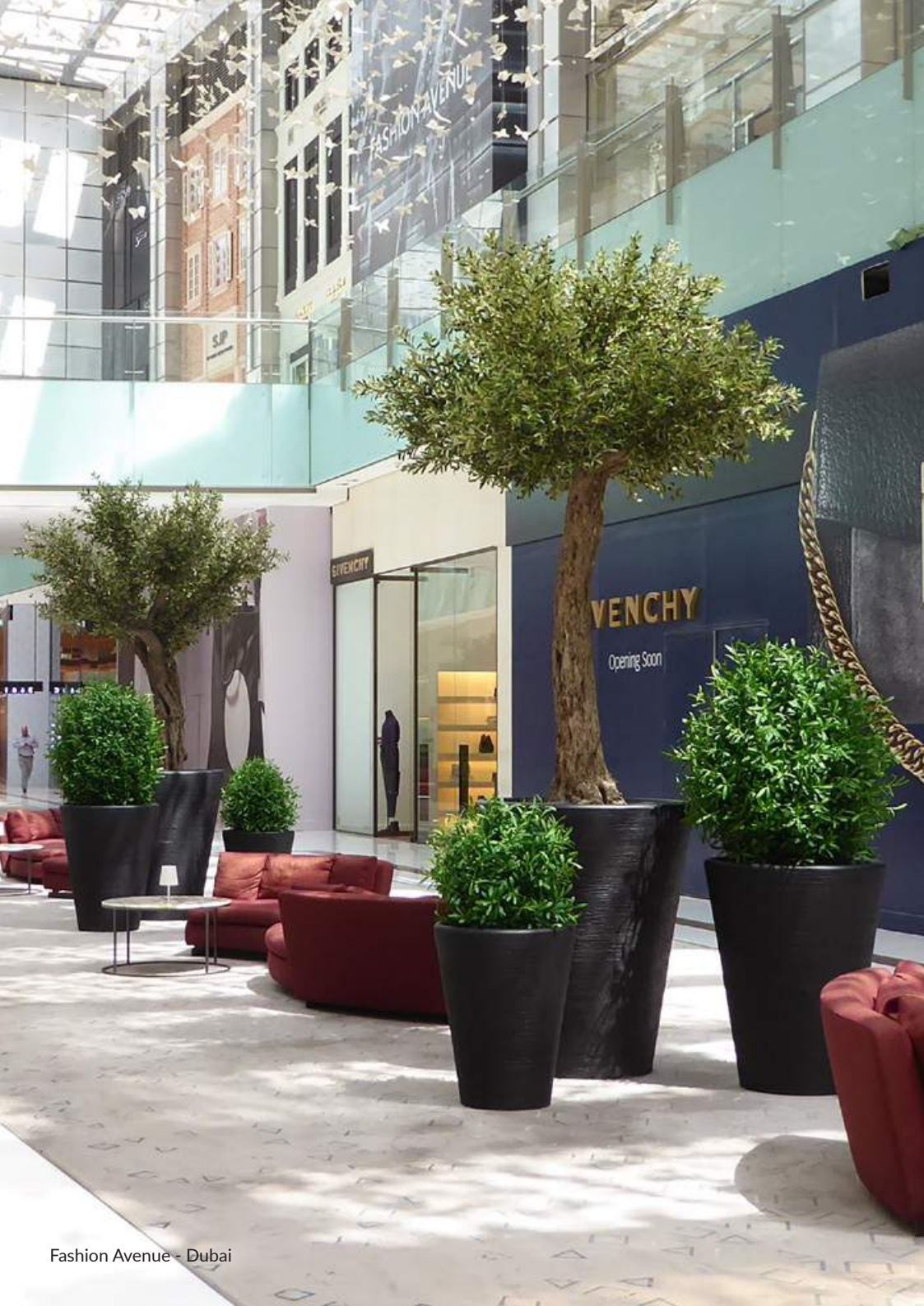
Fashion Avenue - Dubai